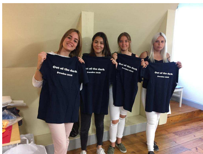
Farewell dinner and awarding of prizes.