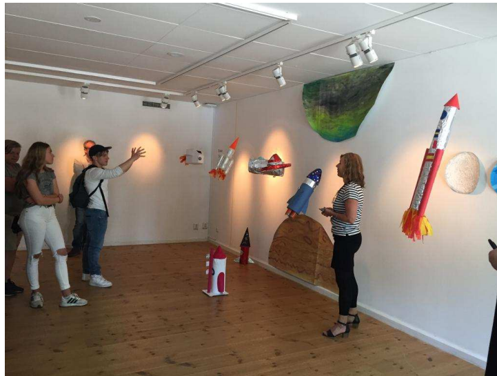
Visiting the Art Museum in Eskilstuna and making our shuttle.