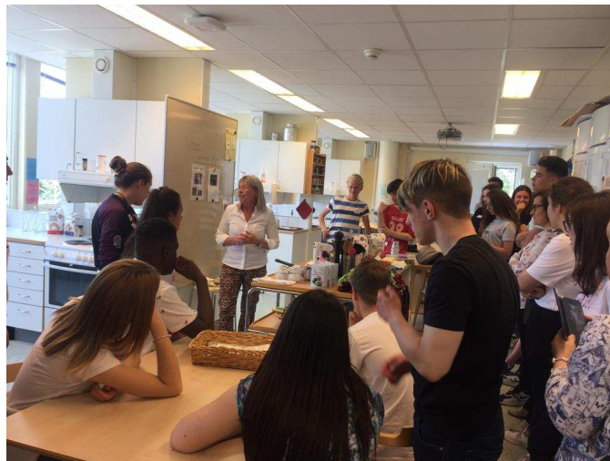
Baking cinnamon buns.