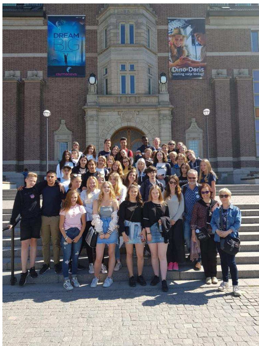
Visiting Stockholm and Cosmonova Museum.