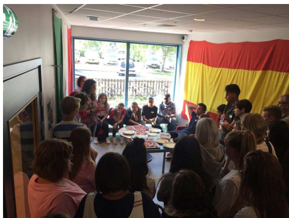
Spanish Fika in the school