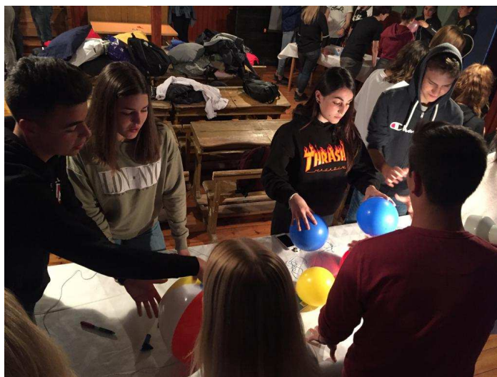
Star gazing outside the town. Creative groups making Solar System.