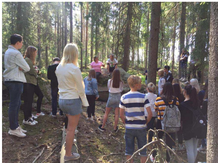
Walking into the wood near the school.