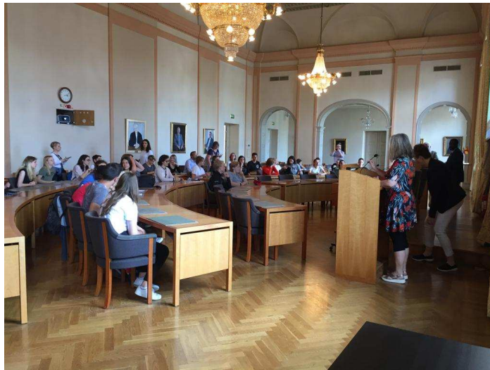
Reception at Town Hall.