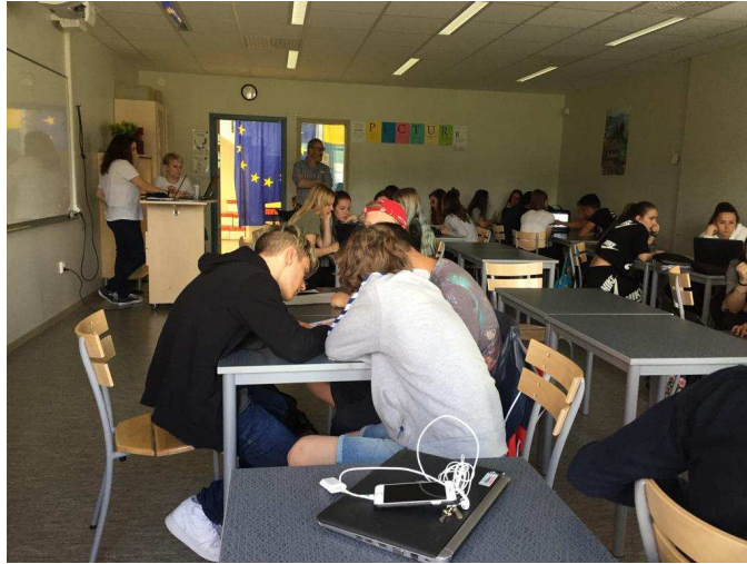
Reading and writing contest about Little Prince.